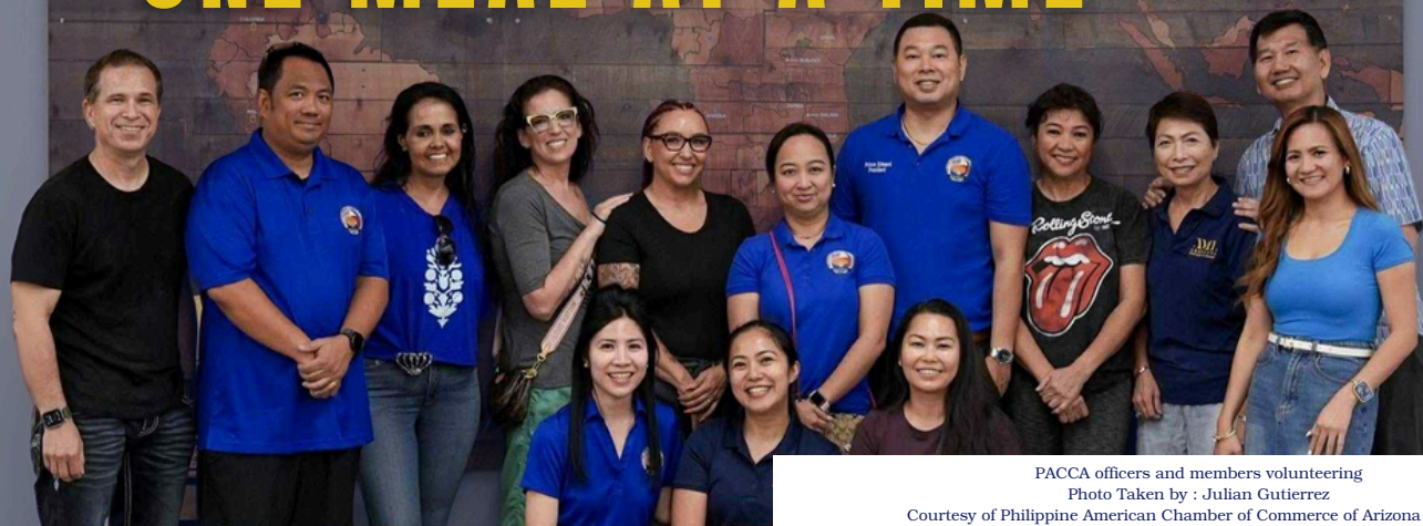
PACCA officers and members volunteering