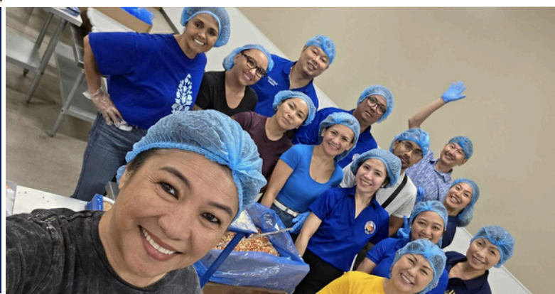
PACCA officers and members volunteering

And yes, we worked hard... but we also had fun! From laughs over assembly lines to spontaneous dance moves in the packing room, it was proof that when PACCA shows up, we show up with heart and energy.